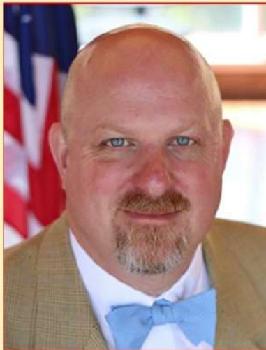
Eugene Halus Freedom Foundation at Valley Forge, PA

(The focus will be on the importance of civic education – both the formal and informal types – that are needed to undergird a functioning democracy. The intent is to raise ideas parallel to Burke’s “little platoons of everyday life” and Tocqueville’s comments about the character of American culture, but with a larger focus on the practical rather than the philosophical. As a nation we largely abandoned the teaching of civics more than a quarter of a century ago, and it clearly shows in our public and private deliberations around politics and the role of citizens in society today. One of the causes for this is a profound lack of knowledge about the nation’s history, its civic and political traditions, and a general loss of much sense of community and social cohesion.)