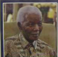
R.N. Mandela Heroes of Transformational Leadership Project