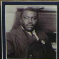
M.M. Garvey Africa in the World Project