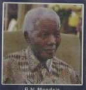
R.N. Mandela Heroes of Transformational Leadership Project